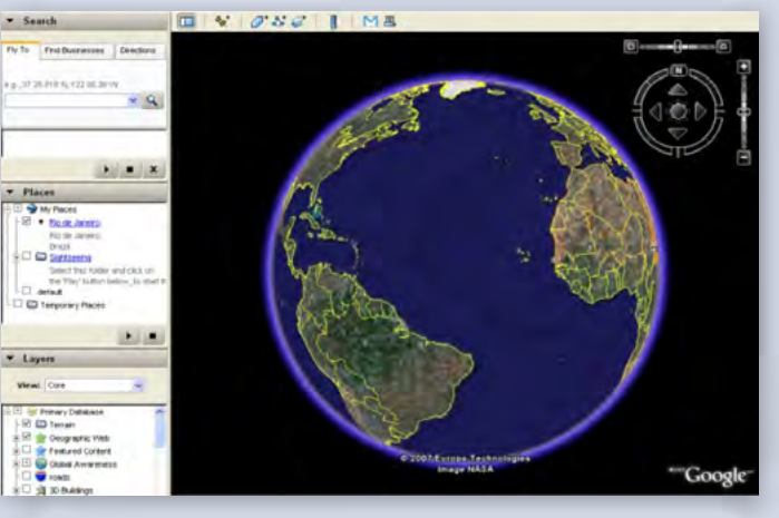
Figure 1 - Google Earth Interface