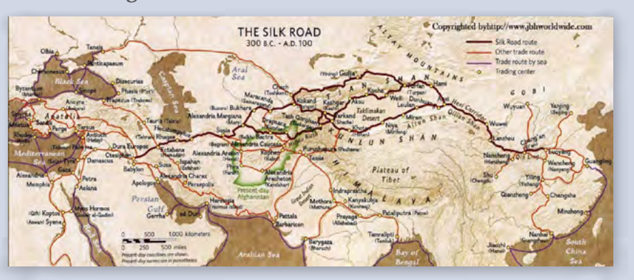
Figure 5 - Marco Polo took the Silk Road