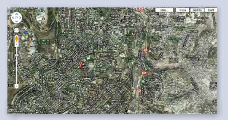
Figure 3 - Map of the city of Jerusalem

The place researched will be the city of Jerusalem, specifically, the Western Wall and the Way of the Cross, in which to identify the transformations that occurred in these critical religious settings. In this setting, a study will be carried out referring to the path taken by Christ in the Holy City, identifying possible stops and length of the journey. It is necessary for students to have prior knowledge about the biblical records of these events.